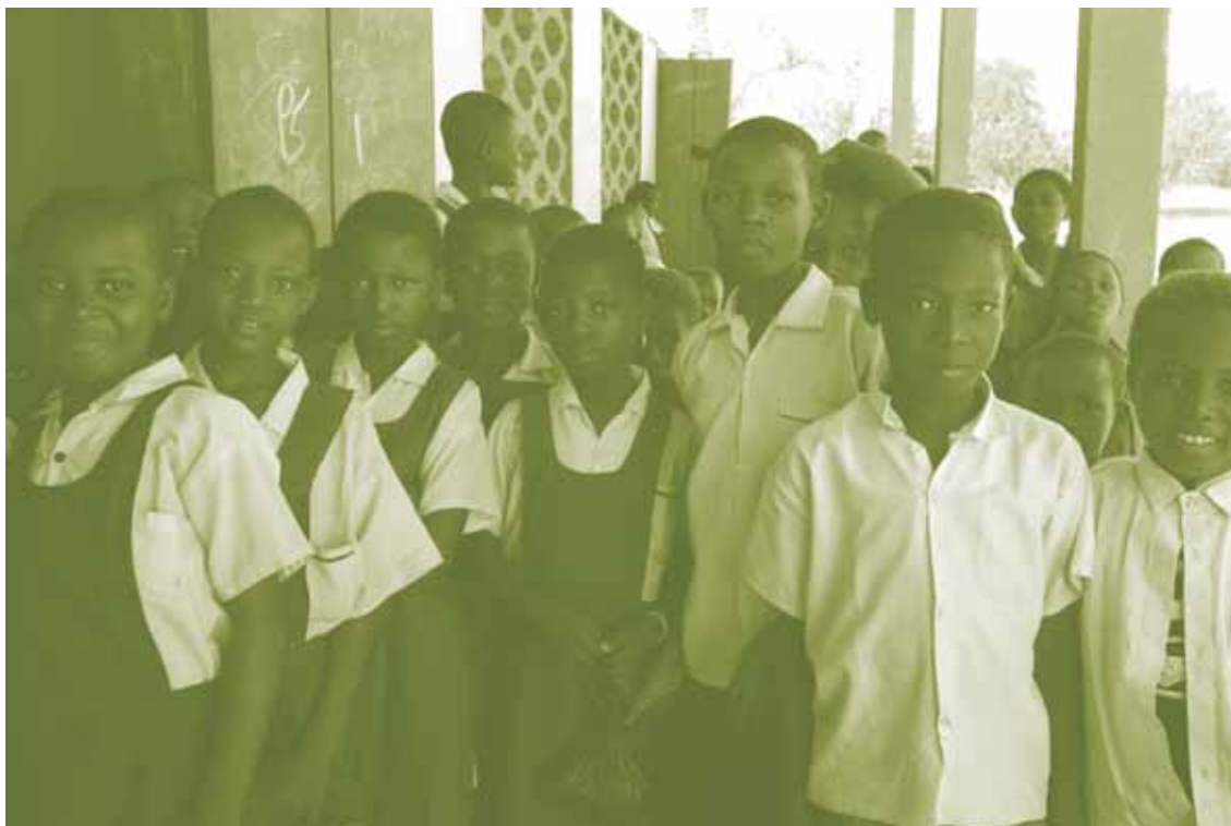
Schoolchildren in Ghana

A major question is whether implementing agencies that can be remarkable in community mobilization and delivery of direct services also possess the expertise for entrepreneurial and business development expertise. Theoretically,