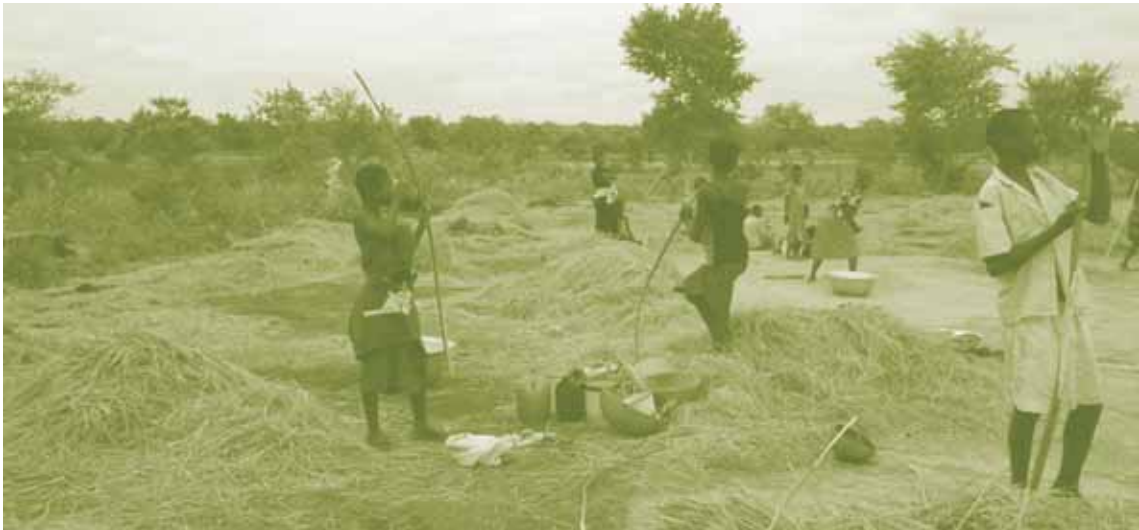
Children harvesting rice in Ghana.

acknowledgement of the problem came through and activities gained momentum. Moreover, the relocation of WACAP's subregional office to Accra from Abidjan added momentum to the project in Ghana.