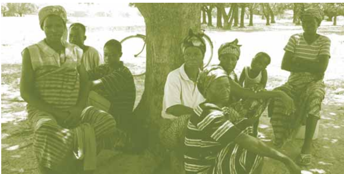
Members of a community child labour committee in Ghana

CEDEP, an implementing partner in Ghana , raised awareness at the national, district (which included the district assembly), and community levels. It targeted opinion and traditional leaders, religious groups and other key persons including parents and the children. Involving parents and guardians in implementation activities made it easier to clarify many misconceptions. One-to-one dialogue and counselling of parents and guardians enabled them to articulate underlying beliefs that contributed to child labour. At celebrations and community events ( durbars ), the parents were encouraged to keep their children in school. Some of WACAP's implementing agencies in Ghana were able to link the children with the government's implementation of a grant for education. The termination of school fees by the Government through the Capitation grant was highlighted as an opportunity for parents to keep their children at school. The Ghana Agricultural Workers' Union (GAWU), in collaboration with the Kassena Nankana District, also embarked on extensive awareness raising aimed at parents, farmers, community leaders and district authorities and philanthropists. At the time the project ended, about 20 individual philanthropists were supporting some of the children to retain them in school.